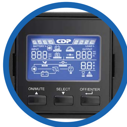
LCD panel with 90° rotation