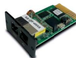
Option card: EMD (Environmental Monitoring Device)