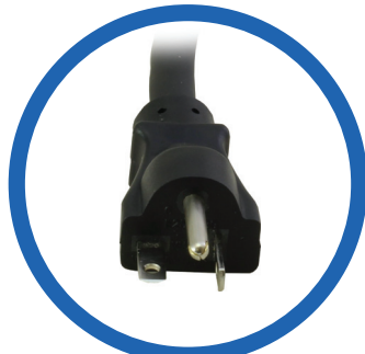
AC power cord NEMA 5-20P