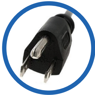
AC power cord NEMA 5-15P